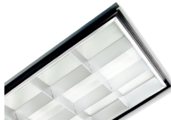
18 CELL PARABOLIC