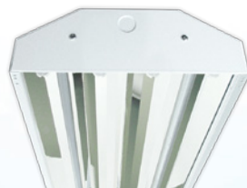
HORIZON HIGH BAY