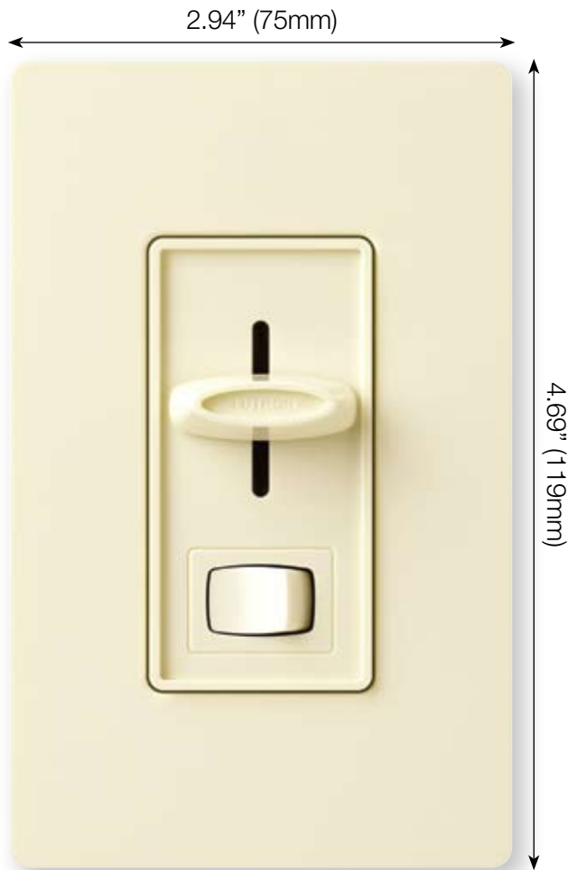
Shown actual size: Skylark® preset dimmer and 1-gang Claro® wallplate in almond (AL)