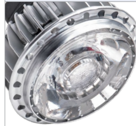
15° Beam Angle