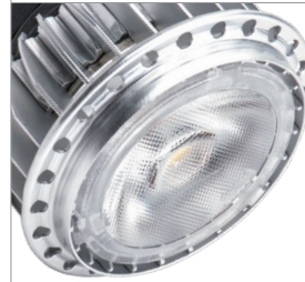
25° Beam Angle