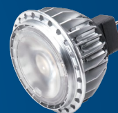
40° Beam Angle