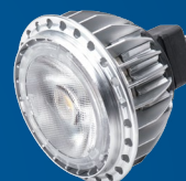
25° Beam Angle