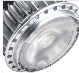
40° Beam Angle