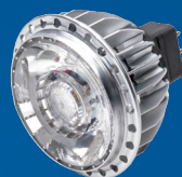
15° Beam Angle

The Cree MR16 LED lamp provides you with a payback of less than one year, using just 8.7 watts of energy. This impressive combination of greater than 80% energy savings and significant maintenance savings finally delivers a true replacement for halogen MR16 lamps.