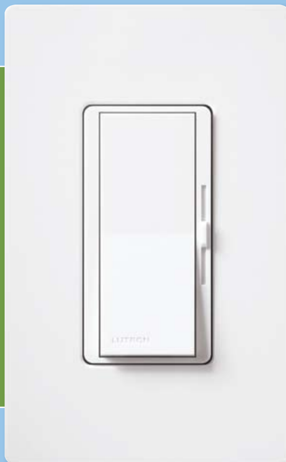
Diva ® eco-dim dimmer (actual size)

Save up to $30 per year by replacing a switch with a Lutron dimmer.*