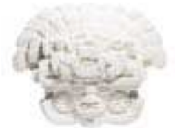
This bright, white light is typical of an MR16 lamp the minute you turn it on.