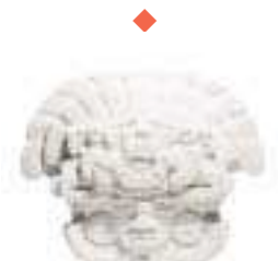
GE's ConstantColor® MR16 lamp won't degrade and will maintain this clean, bright light for the rated life of the lamp.