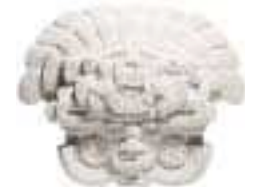
By 1,000 hours, ordinary MR16 lamps lose brightness as lumens degrade.