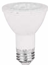
7W = 50W PAR20 30/50K