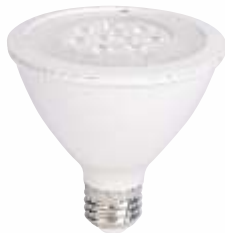
11W = 75W PAR30 30/50K