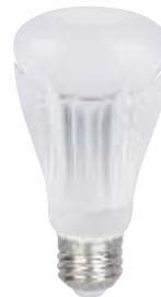
12W = 60W A19 OMNI 27K