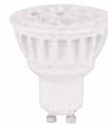
7W = 50W MR16 GU10 30/50K - FL