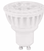
5W = 35W MR16 GU10 30/50K - FL