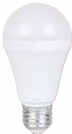
6W = 40W A19 30/40/50K