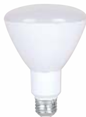
9W = 65W R30 30/50K