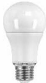
10W = 60W A19 Wide Angle 30/50K