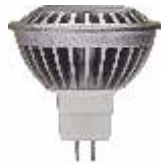
4.5W = 25W MR16 GU5.3 20/30/50K - NFL/FL