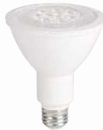
11W = 75W PAR30 (LN) 30/50K