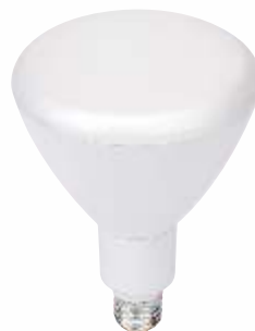
13W/18W = 85W/120W R40 30/50K