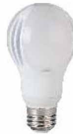
New available June 2014 12W = 60W New A19 OMNI 27K