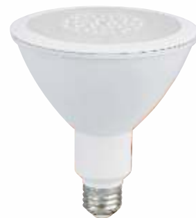
14W/17W = 90W/120W PAR38 30/50K