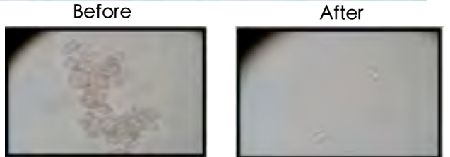
The above photo demonstrates the restriction of spore germination after one single application of No Powdery Mildew™. No Powdery Mildew has 98% efficacy rate on the restriction of further spore germination upon 1st application.