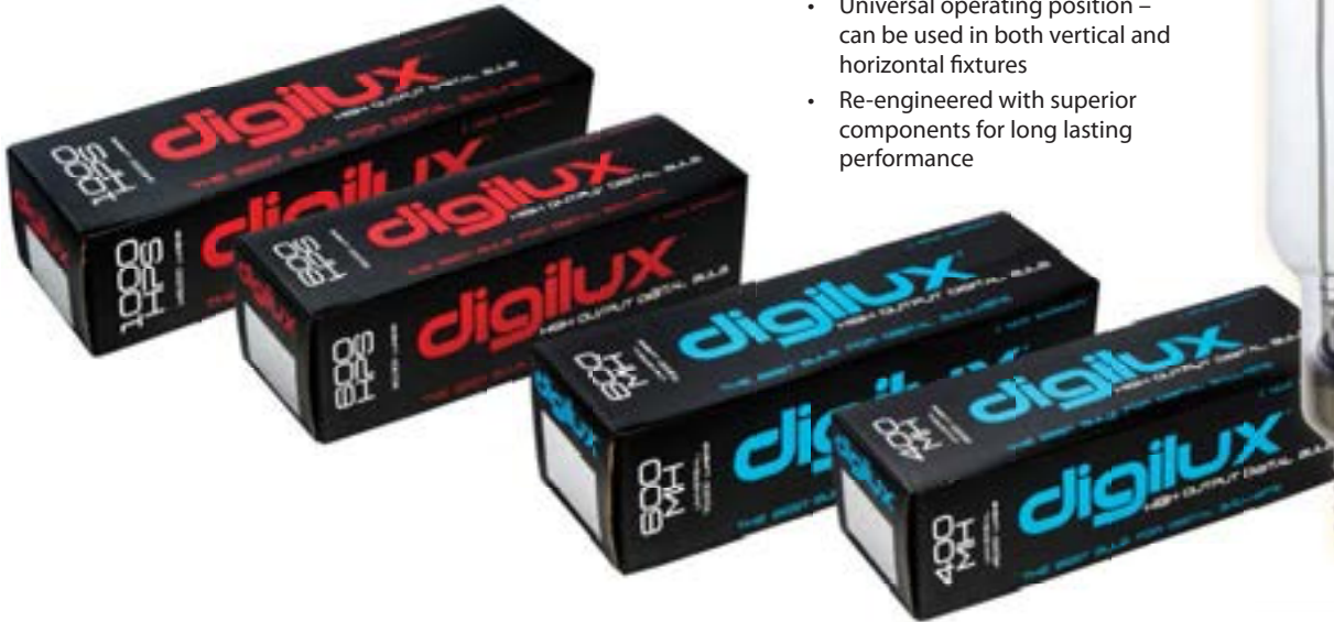
DIGILUX 1000W HIGH PRESSURE SODIUM - DX1000HPS