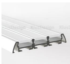
extrusion TRIADA (B4476)