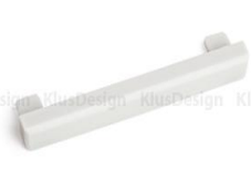
end cap TETRA-78 (24043) TETRA-78 MET (24057)