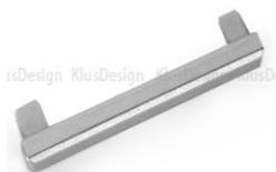
end cap TETRA-43 (24044) TETRA-43 MET (24058)