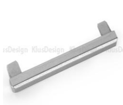
end cap TETRA-43 (24044) TETRA-43 MET (24058)