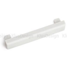
end cap TETRA-78 (24043) TETRA-78 MET (24057)