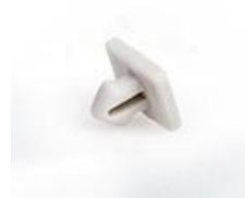
TEKNIK clip (24003)