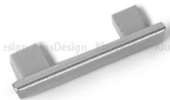
end cap TEST-36 (24040) TETRA-36 MET (24055)