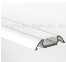
extrusion STOS (B4369)