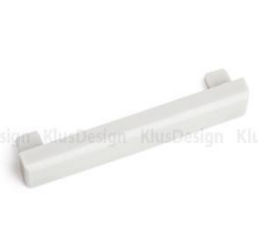
end cap TETRA-78 (24043) TETRA-78 MET (24057)