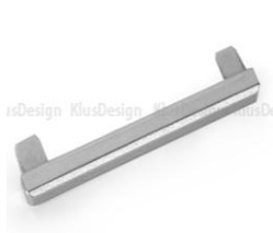
end cap TETRA-43 (24044) TETRA-43 MET (24058)