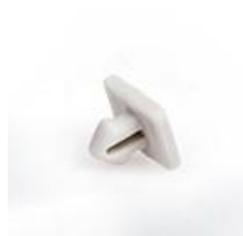
clip TEKNIK (24003)