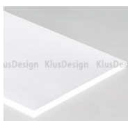
cover SZER (17081)