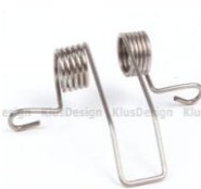
spring KMA (00838)