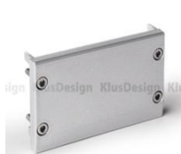
end cap SEPOD-MET KPL. (24106)