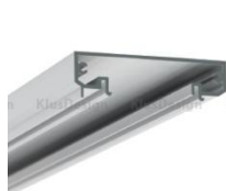
mounting base TESPO KPL. (18020)