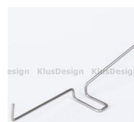
spring GP (00293)