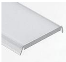
cover type HS22 frosted (17011) clear (17022)