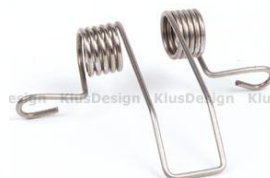
spring KMA (00838)