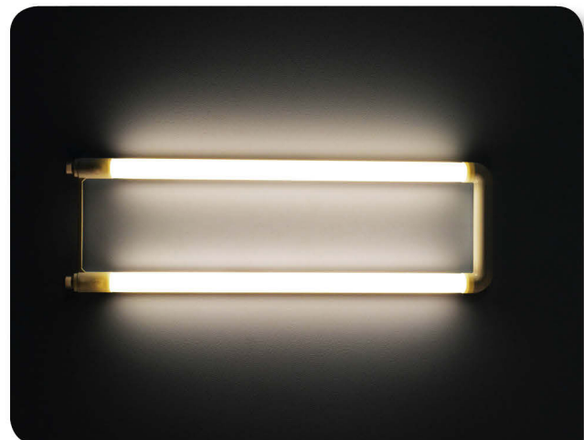
OTHER LED U-BENT