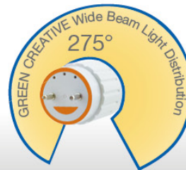
Lamp Front View

This lamp uses an innovative glass design that diffuses heat and light more evenly. As a result of its compact light engine, this lamp produces a light emitting area of 275°. This wider beam angle improves a fixture's total light distribution and creates a more complete lighting effect.