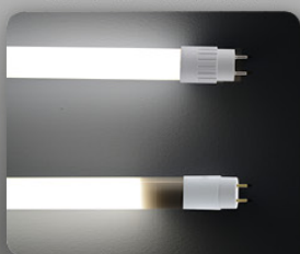
Other LED Tubes