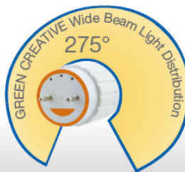
Lamp Front View

This lamp uses an innovative glass design that diffuses heat and light more evenly. As a result of its compact light engine, this lamp produces a light emitting area of 275°. This wider beam angle improves a fixture's total light distribution and creates a more complete lighting effect.