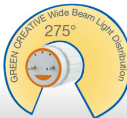
Lamp Front View

This lamp uses an innovative glass design that diffuses heat and light more evenly. As a result of its compact light engine, this lamp produces a light emitting area of 275°. This wider beam angle improves a fixture's total light distribution and creates a more complete lighting effect.