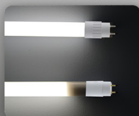
Other LED Tubes