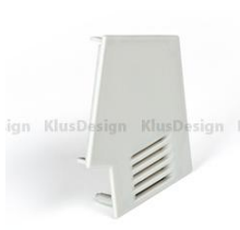
end cap IMET right, (24016) left, (24017)