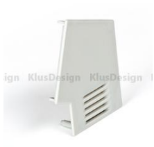
end cap IMET right, (24016) left, (24017)