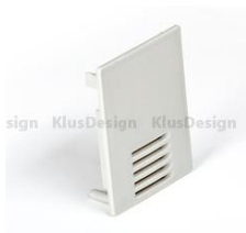
end cap INTER (24011)