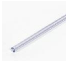
security rod (00806)