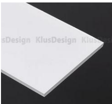
cover type HSP47 frosted (17051) clear (17062)