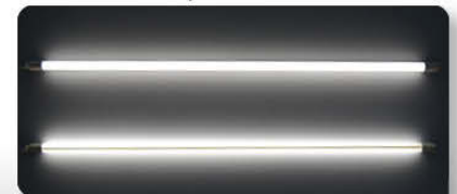
Lamp Back View