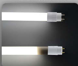
Other LED Tubes