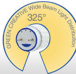
Lamp Front View

This lamp uses an innovative coated glass design that diffuses heat and light more evenly than plastic. As a result of its compact light engine, this lamp produces a light emitting area of 325°. This wider beam angle improves a fixture's total light distribution and creates a more complete lighting effect.