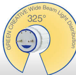
Lamp Front View

This lamp uses an innovative coated glass design that diffuses heat and light more evenly than plastic. As a result of its compact light engine, this lamp produces a light emitting area of 325°. This wider beam angle improves a fixture's total light distribution and creates a more complete lighting effect.