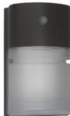
photo controller available