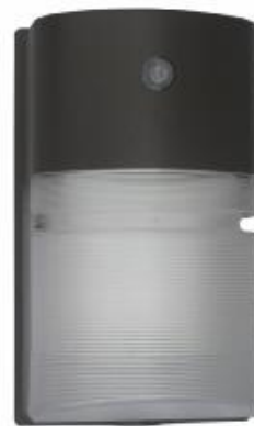
photo controller available