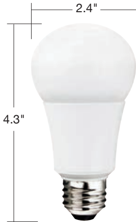
7W Omni-Directional A-Lamp