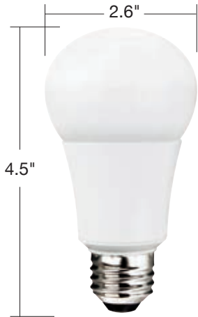
10W Omni-Directional A-Lamp