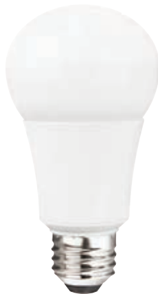
7W Omni-Directional A-Lamp