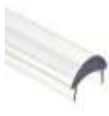
cover type S (00220)