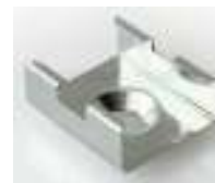
mounting bracket zinc (1072) chrome matt (1345)