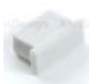
end cap without hole (1059) with hole (1060)