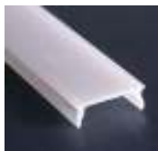
cover type K frosted (1547) transparent (1548)