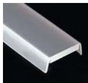
cover type HS frosted (1369) transparent (1370)