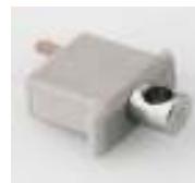
electricity conductive end cap (1443)