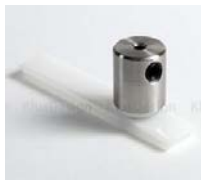
MULTI fastener (00214)