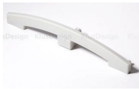
end cap (00305)