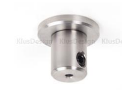
fastener for drywall ceiling (1559) for wall (00093)