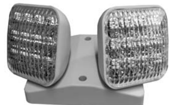
Double Lamp with No Options