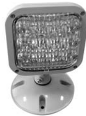
Single Lamp with Weatherproof (WP) Option