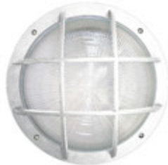
Fits QSSI #WPR40GRWH Bulkhead Fixture

LED Conversion Kit Model No: CBLK36/350/50 Fits Lighting Housing: QSSI #WPR40GRWH Bulkhead Fixture