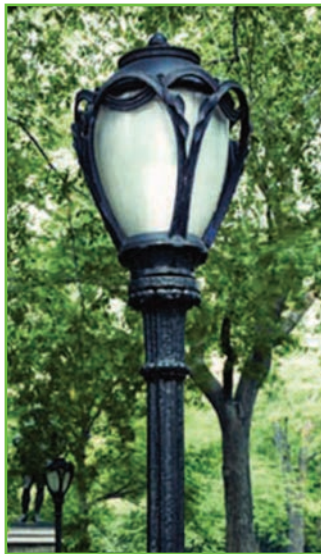
Acorn cover not included. Existing acorn fixtures will still function with LED lighting.