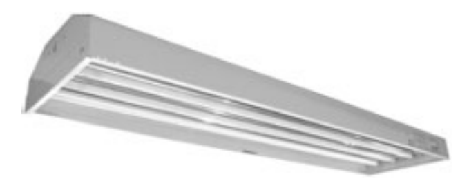
LAMPS NOT INCLUDED

Any housing component that fails due to manufacturer's defect is guaranteed for two years from time of shipment. Ballasts are warrantied for five years from time of shipment. Warranty does not apply to damages caused by improper installation, abuse, fire or acts of God. Lamp is not covered by manufacturer's warranty.