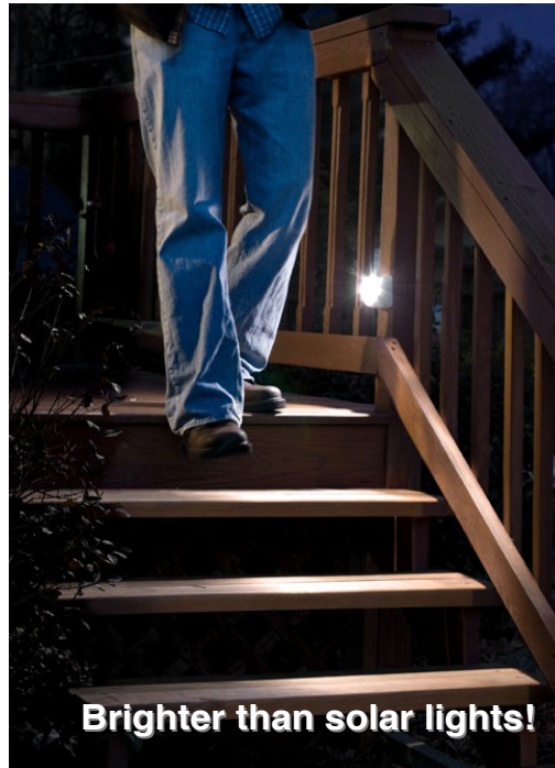
Brighter than solar lights!