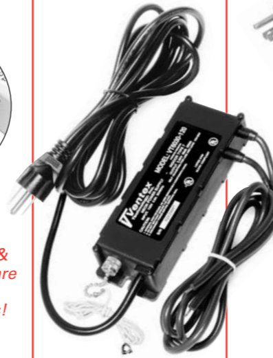
VT 6030-120 & VT 6030-240