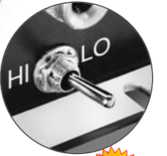
Dimmable VT 12030D-120