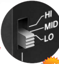
Dimmable VT 9030D-120 & VT 9030D-240

Three levels of lighting 100%, 65% & 45%!