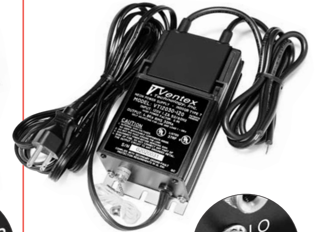
VT 12030-120 & VT 12030-240