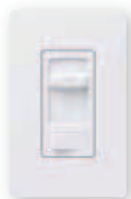
Skylark Contour™ C•L™ Gloss colors