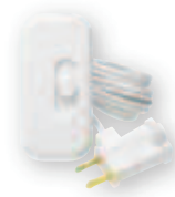
Credenza® C•L™ Black (BL), White (WH), and Brown (BR)