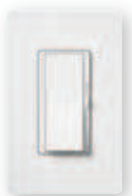
Diva® C•L™ Gloss and Satin Colors®