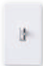
Ariadni® C•L™ Gloss colors (excluding gray)