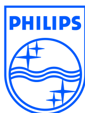
LED E12 BA9

©2009 Koninklijke Philips Electronics N.V.