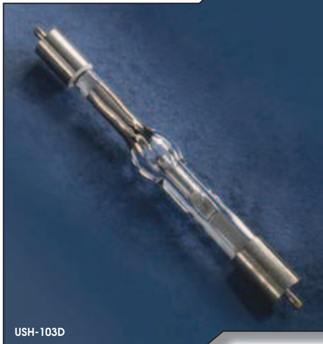
USH SHORT ARC MERCURY LAMP