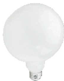
DuraMax Deco WH