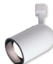
NTH-105W White Roundback Cylinder with Black Baffle