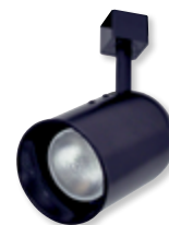
NTH-105B Black Roundback Cylinder with Black Baffle