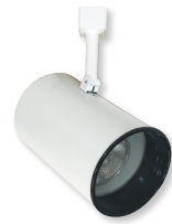
W/A White Finish