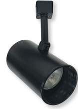
B/A Black Finish