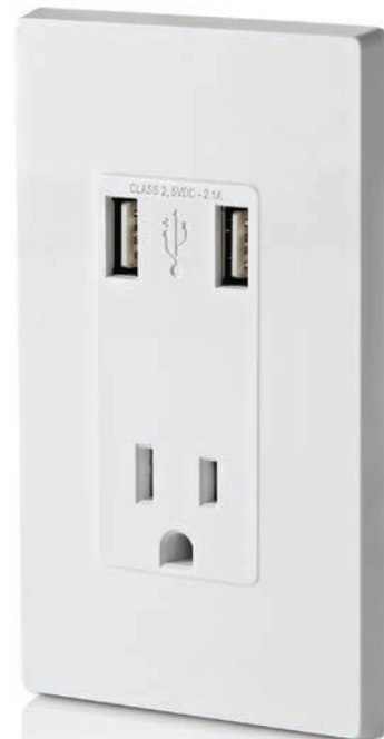
Cat. No. T5630 Shown with screwless wallplate 80301 sold separately