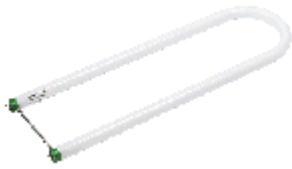
F- T8- URS Med Bipin/GB