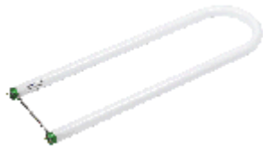
F-T8-URS Med Bipin/GB