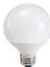
EL/A G25 Med.