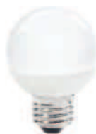
EL/A G16 1/2 Med.