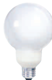
EL/A G30 Med.