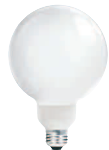
EL/A G40 Med.